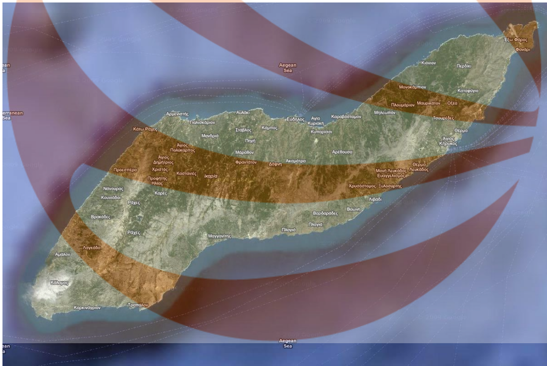
Map N° 2: Icaria satellite map